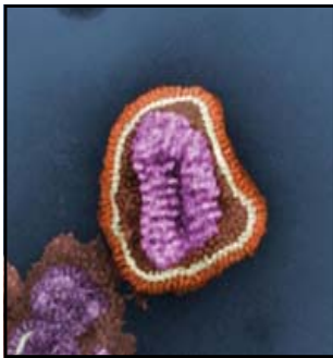
Influenza virus particle.

So far the 2008-09 influenza season has been relatively quiet in the United States. Activity has been low. However, preliminary data from a limited number of states indicate a high prevalence of influenza A (H1N1) virus strains resistant to oseltamivir, an antiviral medication also known as Tamiflu®. Despite this high level of resistance, the 2008-09 influenza vaccine is expected to be effective in preventing or reducing the severity of illness with the currently circulating viruses, including this oseltamivir resistant one. These same virus strains, though, have been susceptible to zanamivir (Relenza®), amantadine (Symadine®, Symmetrel®) and rimantadine (Flumadine®). So far there does not appear to be a difference in symptom severity between oseltamivir resistant and oseltamivir sensitive influenza A (H1N1) viruses.